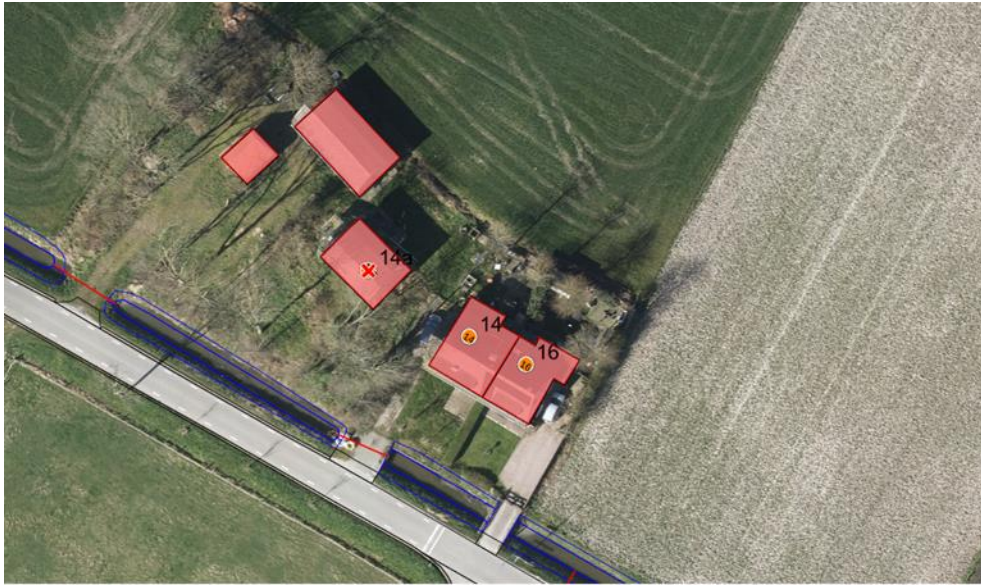
Fig. 3 huidige situatie